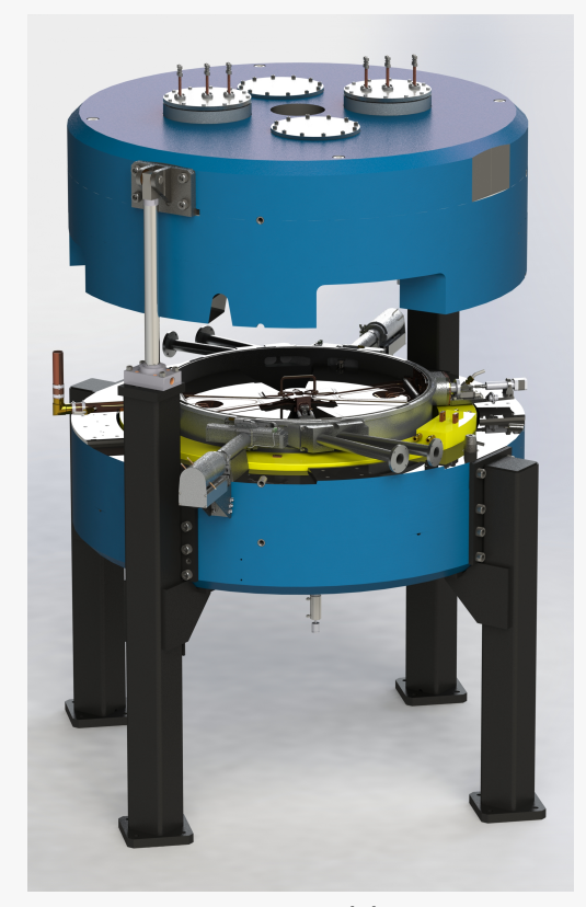
Best 6–15 MeV Compact Variable Energy Cyclotron System (Open View)

Best Theratronics Ltd. logo — www.theratronics.com