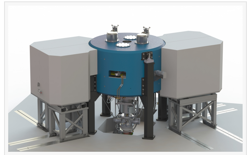
Best 6–15 MeV Compact Variable Energy Cyclotron System (Closed View with Shielding)

https://www.einpresswire.com/article/543980187/best-cyclotron-systems-is-proud-to-introduce-the-new-versatile-best-model-b35adp-alpha-deuteron-proton-cyclotron