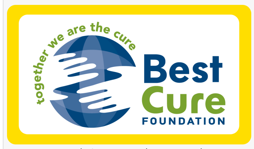
Best Cure Foundation — www.bestcure.md

Diagnosis/Treatment/Research and Green Energy Developments.