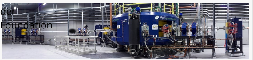
Best 70 MeV Proton Cyclotron installed in INFN, Legnaro, Italy