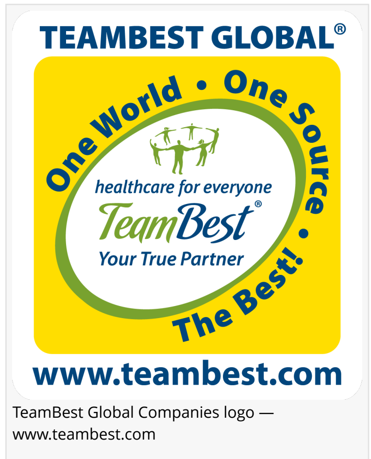
TeamBest Global Companies logo — www.teambest.com