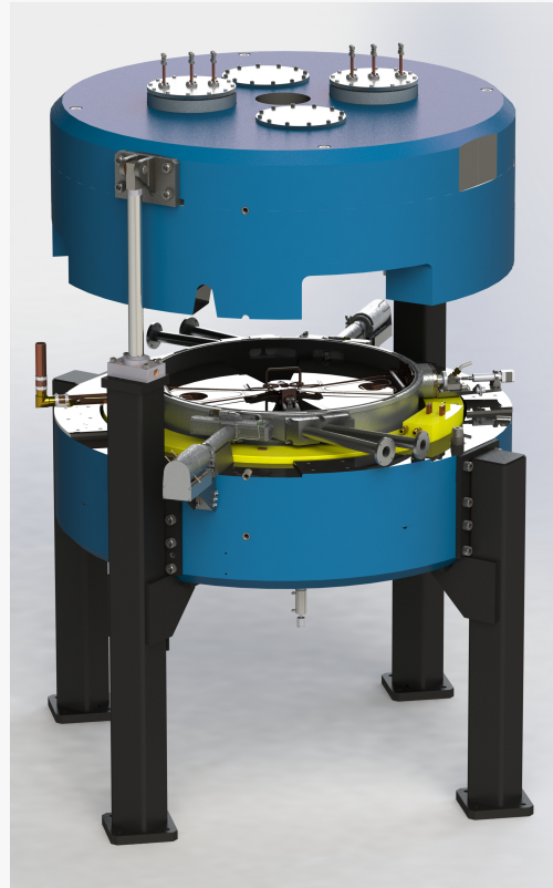
Best 6–15 MeV Compact Variable Energy Cyclotron System (Open View)