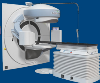
Best™ GammaBeam™ 300-100 CM Equinox™ Teletherapy System with Avanza 6D Patient Positioning Table