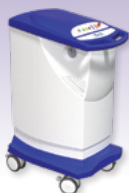
Best™ HDR Remote Afterloader