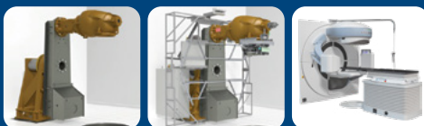
Teletherapy System Upgrade Kit for all old Theratron units, 80 or 100 cm including IMRT capabilities with built in or external MLC