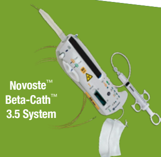
Novoste™ Beta-Cath™ 3.5 System

Best™ Theratronics A TEAMBEST GLOBAL COMPANY