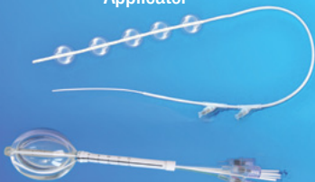
Best™ Breast Double-Balloon Brachytherapy Applicator