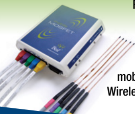
mobileMOSFET Wireless Dosimetry System