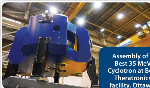
Assembly of a Best 35 MeV Cyclotron at Best Theratronics facility, Ottawa, Ontario, CA