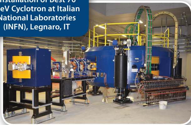
Installation of Best 70 MeV Cyclotron at Italian National Laboratories (INFN), Legnaro, IT