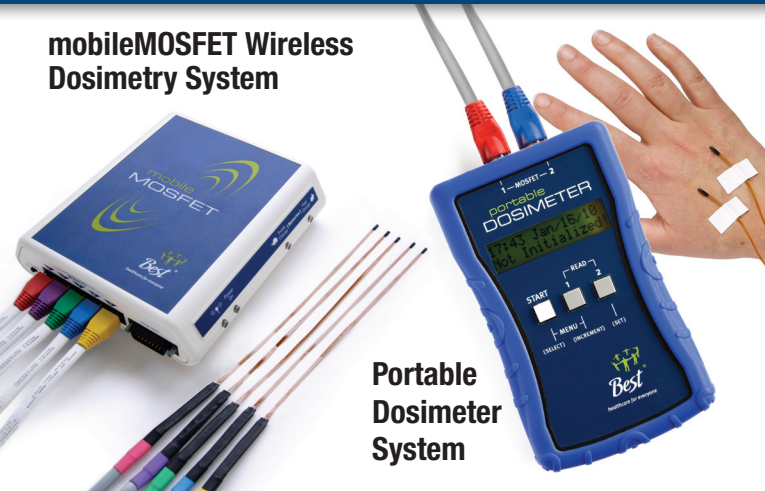
Portable Dosimeter System