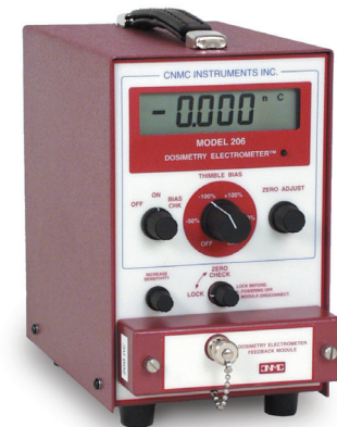
Model 206 Dosimetry Electrometer