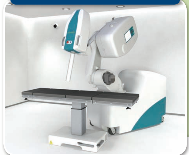
Best™ E-Beam™ Robotic IORT Linac System