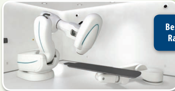
Best™ X-Beam™ Robotic Radiosurgery System