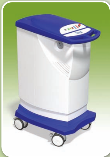
Best™ HDR Afterloader