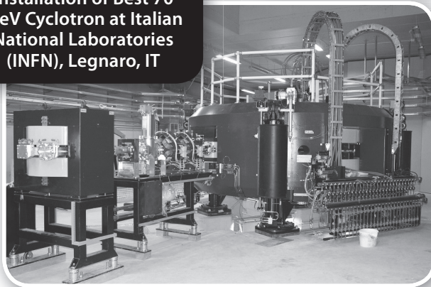
Installation of Best 70 MeV Cyclotron at Italian National Laboratories (INFN), Legnaro, IT