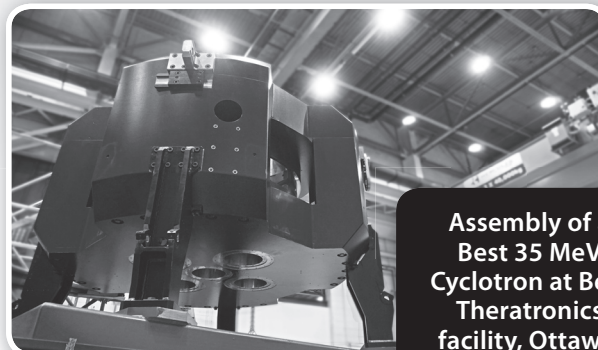
Assembly of a Best 35 MeV Cyclotron at Best Theratronics facility, Ottawa, Ontario, CA