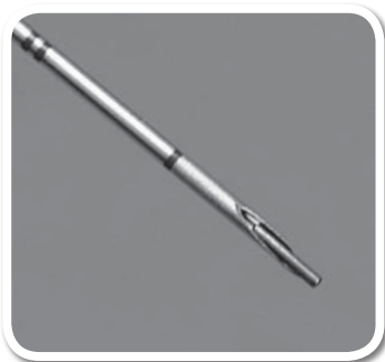
Loose Seed Loaded into Localization Needle