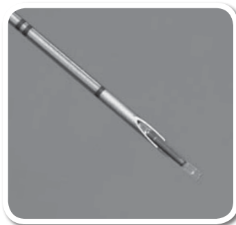
Seed in Tissue-Absorbable Strand Material

We ship your order within 24 hours Sterile and Non-Sterile