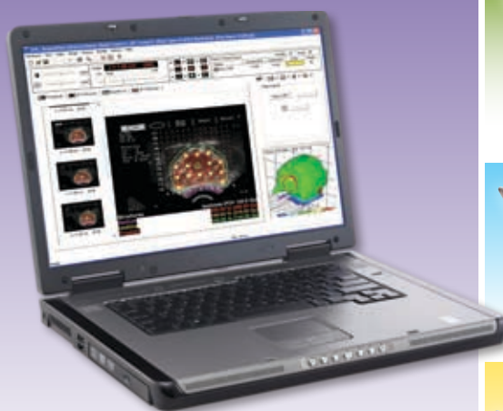
Best™ Treatment Planning System for LDR, HDR Brachytherapy, SRS, SBRT, Tomotherapy & Teletherapy with IMRT/IGRT