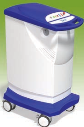
Best HDR Remote Afterloader

Features include \pm 5\% field flatness over 70 cm x 200 cm at 10 cm depth, and imaging for position verification of organ attenuators.