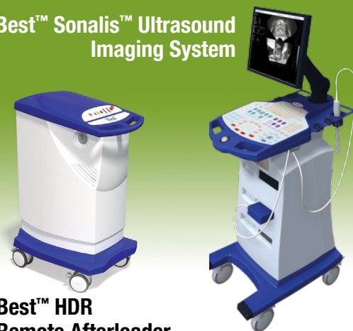
Best™ HDR Remote Afterloader

Best Medical is the only company that makes custom seeds and strands to your exact specifications — shipped within 24 hours, 7 days a week, sterile & non-sterile!